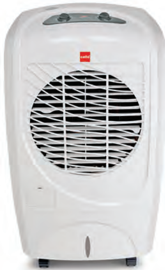
Wave Wood Wool 50 L Water Tank