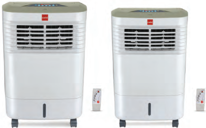
Trendy 22 + Honeycomb | 22 L Water Tank