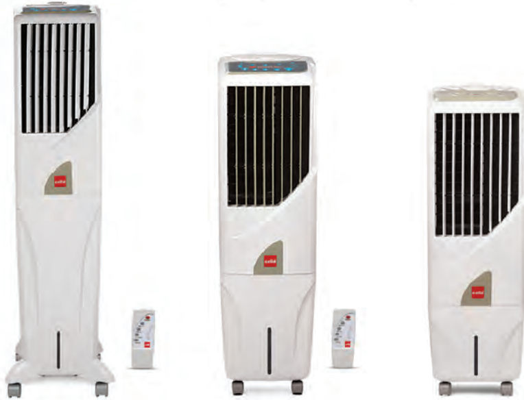
Tower 15 Honeycomb | 15 L Water Tank